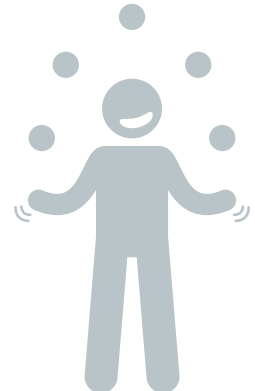
Kanawaapamin! Watch me!