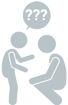
Kakweechimin!* Ask me!