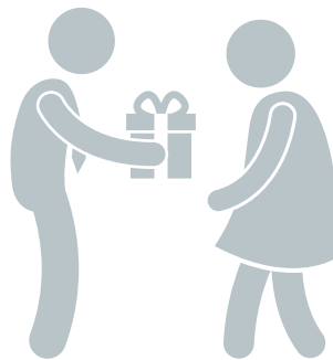
Miwin! Give it to me!