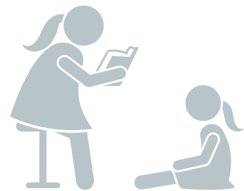
Aachimostawin! Tell me a story!

* kakweechimin/kweechimin are acceptable variations