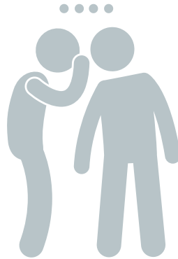
Wiihtamawin! Tell me!