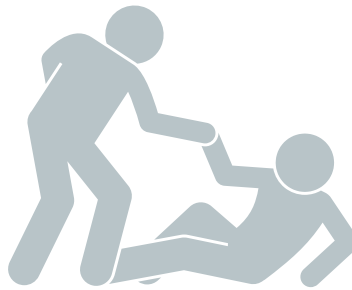
Wiichihin! Help me!