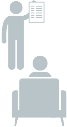
Waapahtahin! Show me!