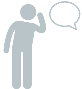
Natohtawin! Listen to me!